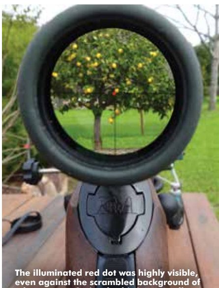
The illuminated red dot was highly visibl even against the scrambled background a lemon tree. Seriously, this is an exceller huntina scope