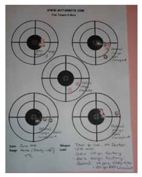
Representative three-shot groups from this lightweight rifle were excellent - one even nudging half MOA.

- something I consider very brave. Franc sent some groups he had shot with factory and reloaded ammunition which were mighty impressive, hovering around the MOA mark and better. Considering the Titan 16 Luxury is a light-barrelled, dedicated hunting rifle, I figured MOA very good indeed and didn't think any deer shot would tell the difference, but just for fun decided to do a little work off the bench myself.